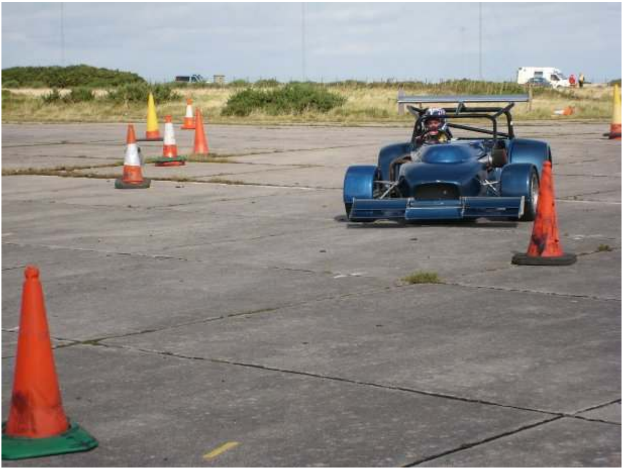
You get a good view of the paddock entrance when you are in the A1 Class