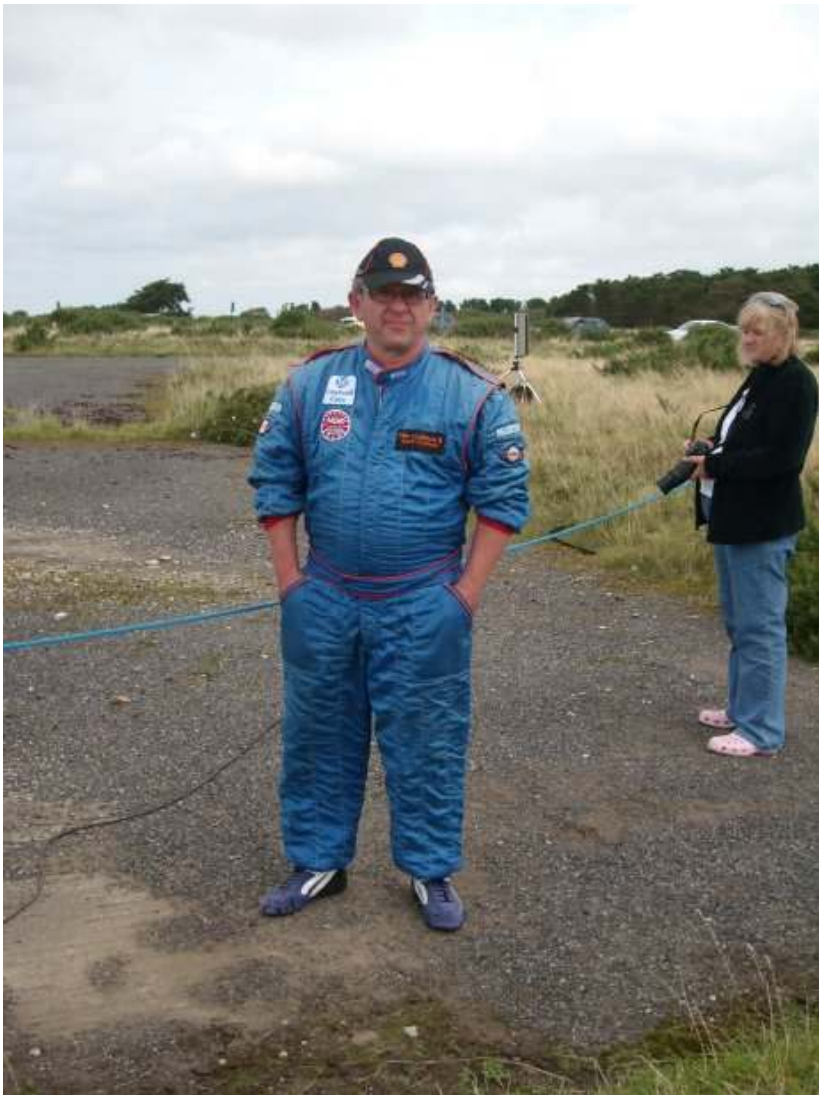
One of the A1 Class Superb Athletes