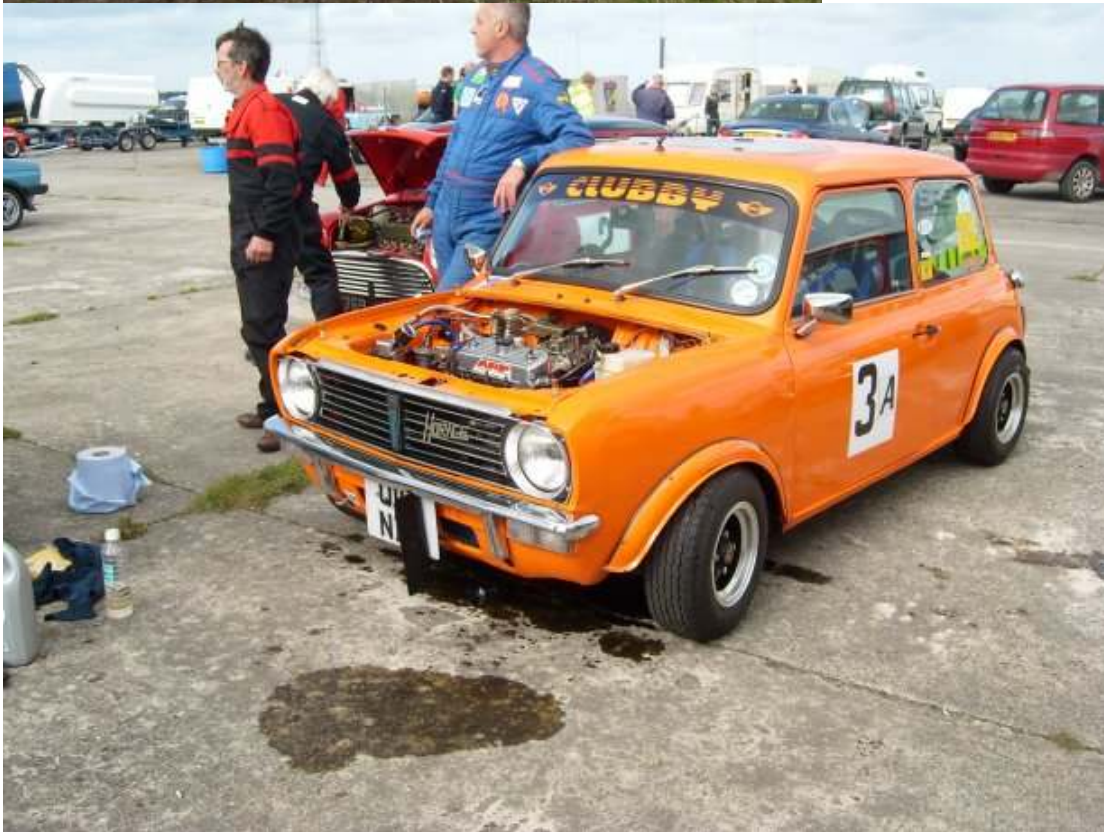
A Slight oil leak, actually, all of it!