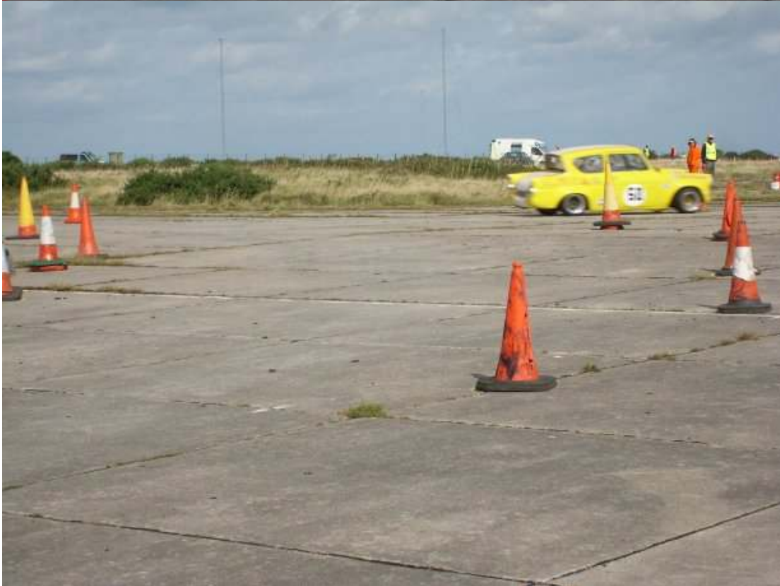
A few of the other competitors at speed